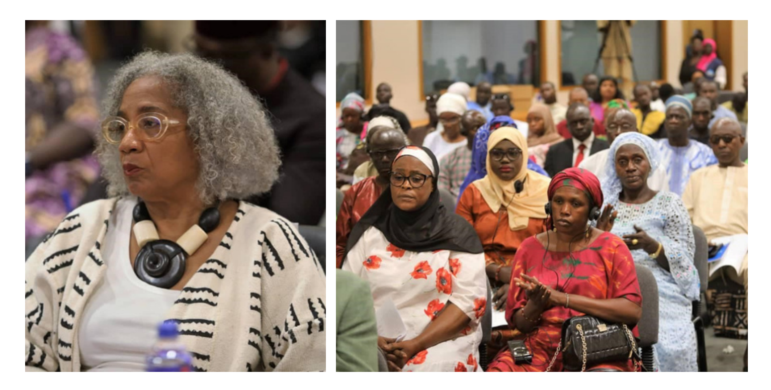
U.S Ambassador to The Gambia