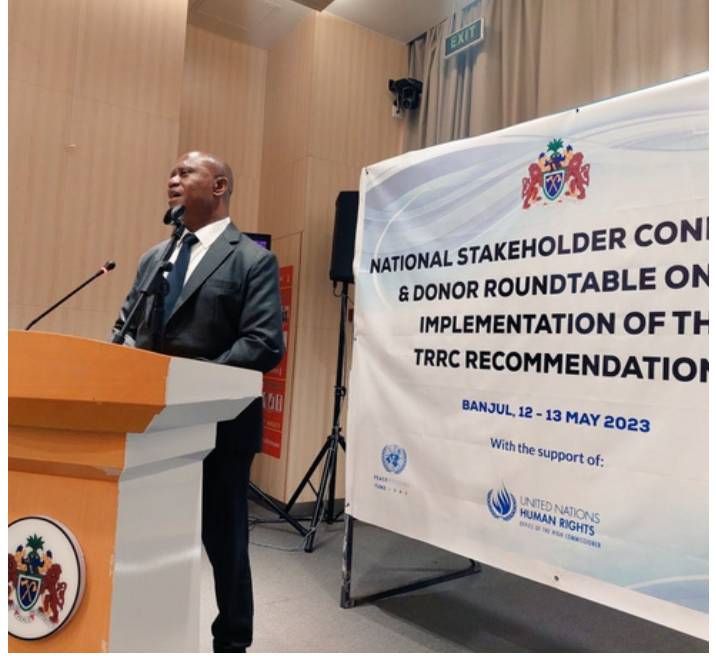
Solicitor General giving the closing remarks