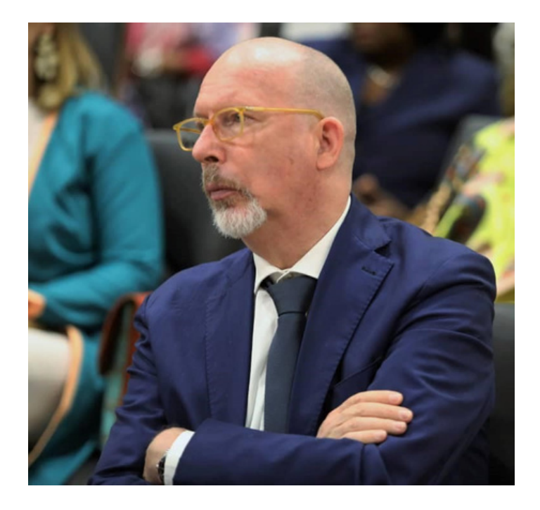
EU Ambassador to The Gambia